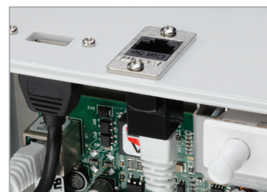
PIM400-1501 has RJ-45 and USB external connectors to make installation easy.